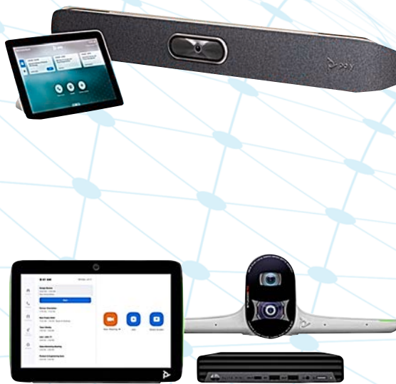
Poly Room Bars and Bundles