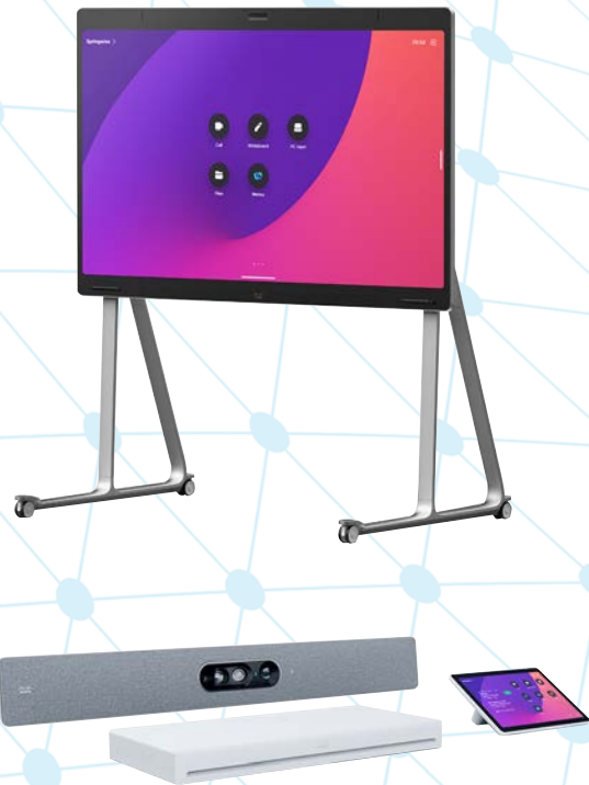
Cisco Endpoints and Room Kits

We can help you find and implement the right solutions for your unique needs, from platforms to peripherals, cameras to speakers, room bars to free standing boards.