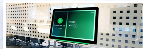
Room reservation panels