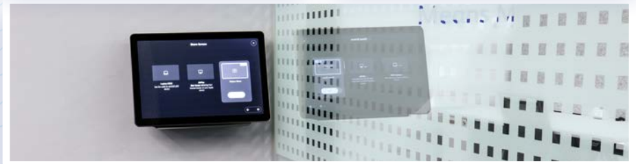
Speakers and microphones that are low-profile and esthetically pleasing. Tabletop or wall mounted room controls