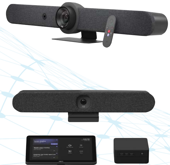
Logitech Room Bars and Kits