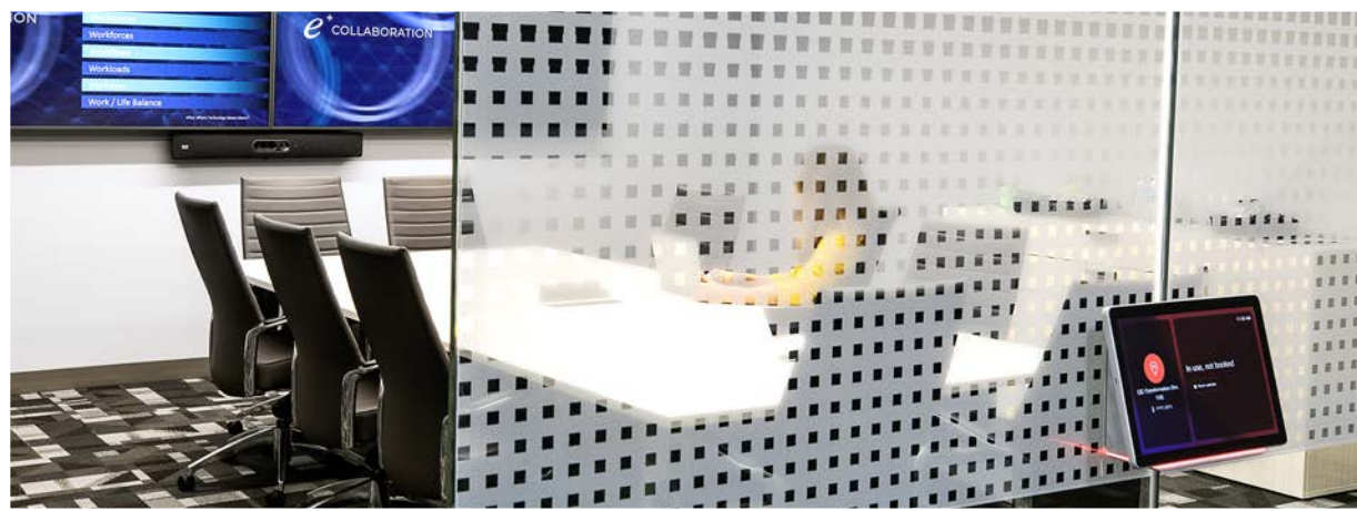
Customizable privacy screen technology