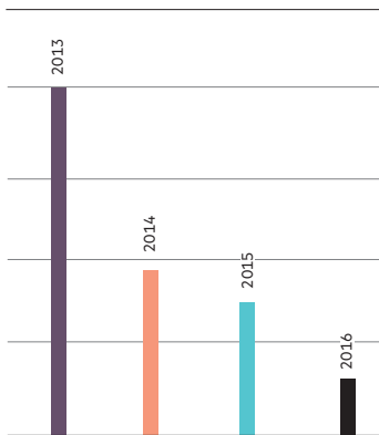
Figure 3 Incidents requiring customer intervention